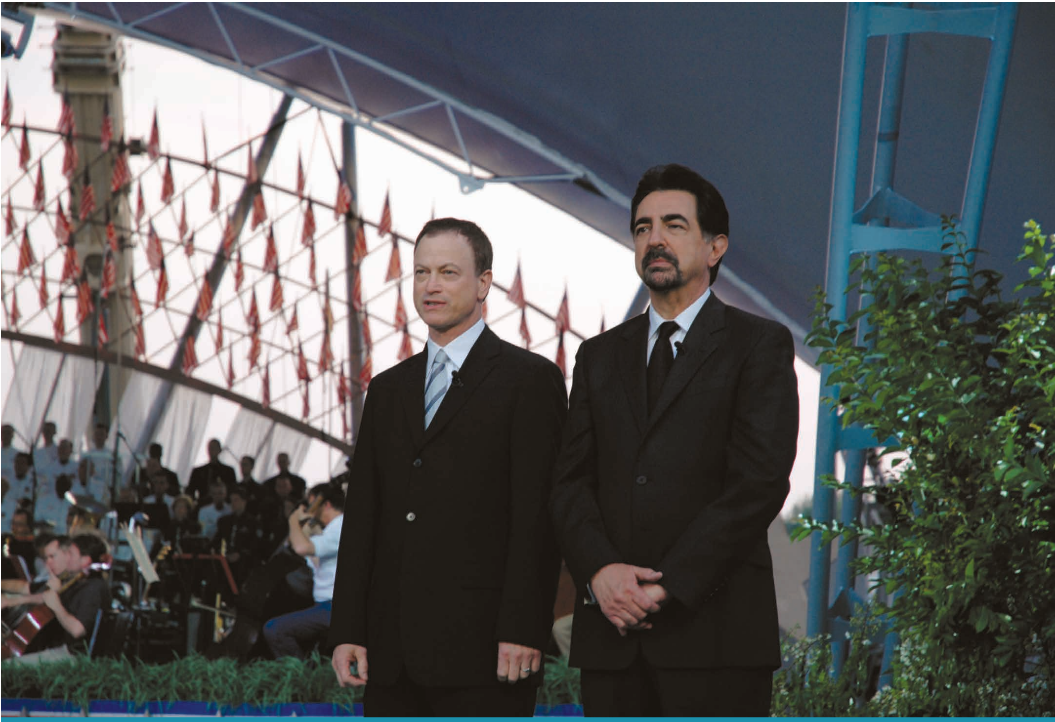
Above: Gary Sinise and Joe Mantegna at the Memorial Day concert in 2010. Left: Mantegna takes pride in supporting the men and women in uniform.

Mantegna found his passion for military causes after hosting the 2002 Memorial Day Concert, an emotional telecast haunted by the memories of the 9-11 attacks the year before.