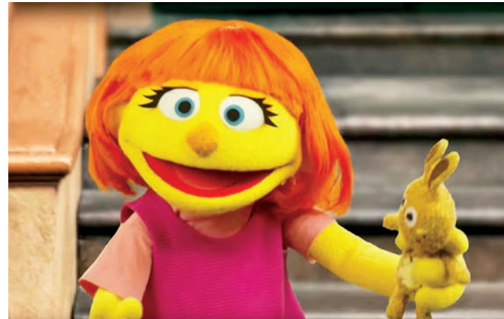
Sesame Street recently introduced an autistic puppet named Julia.

The ultimate financial salvation came from the key hire of Jim Henson, whose puppets known as the Muppets delighted kids. His creations were innovative, clever and amusing, with dialogue that worked for kids and parents on different levels.