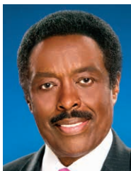
THE JOSEPH M. QUINN AWARD For Lifetime Achievement