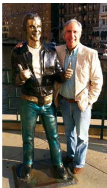
Henry Winkler stands with the statue of the Fonz in Milwaukee.