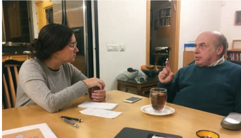
Weiss has a conversation with Natan Sharansky, an Israeli politician, human rights activist, and author who, as a refusenik in the Soviet Union during the 1970s and 1980s, spent nine years in Soviet prisons.

hard to ignore what people tell me is the narrative in favor of what I think all good journalists are supposed to do, which is to pursue the truth, and pursue the hard story, even when it's politically inconvenient. The other thing I'm proud of, frankly, is walking away from the New York Times , which, by at least by all external measures, is the pinnacle of American journalism. I walked away because there are things that I feel are more important than having a prestigious job or bragging rights."