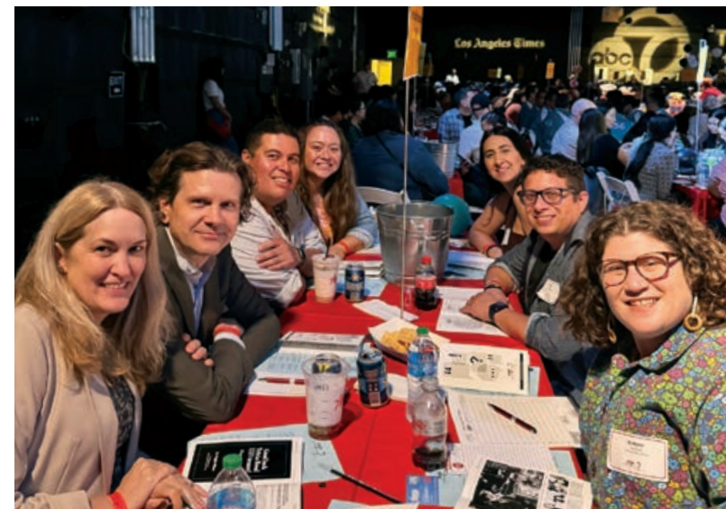
The LA Press Club supports and participates in events hosted by fellow journalism groups such as the Asian American Journalists Association's annual Trivia Bowl, seen above.

Freedom is not a gift from heaven... we must fight for it every day.