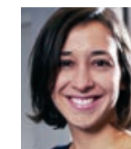
Sarah Krouse The Wall Street Journal