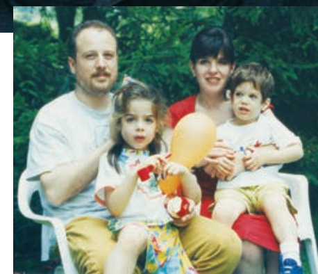
Gershkovich family photos...