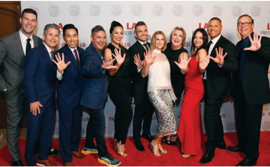
Above: It looks like the KTLA5 team is out in force!