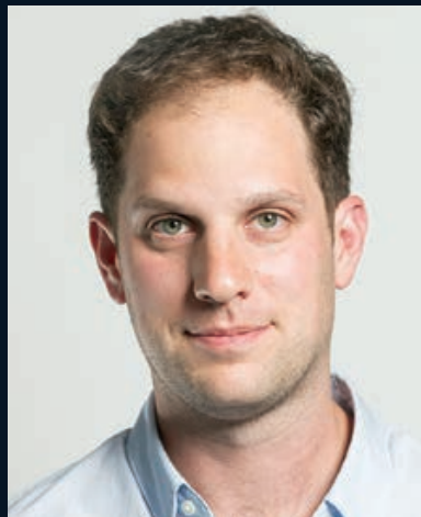
Wall Street Journal