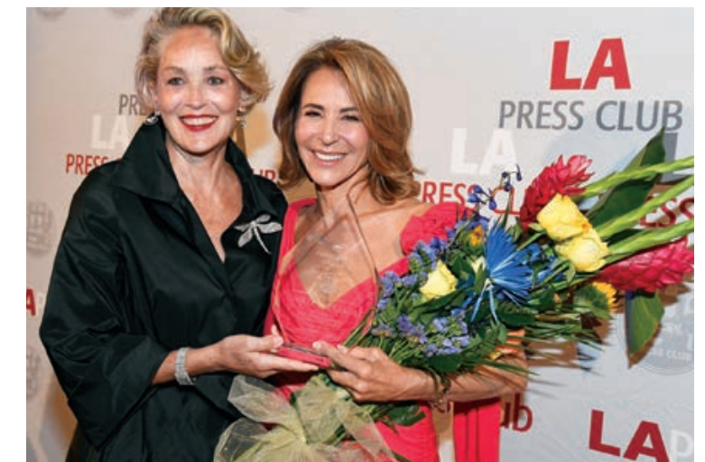
Clockwise from above: At the 2023 National Arts & Entertainment Journalism awards, Henry Louis Gates, Jr. received the Luminary Award for Career Achievement; Legend Awardee, Barbara Eden, was introduced by Hal Linden; filmmaker Roger Corman, received the Distinguished Storyteller Award; at the Southern California Journalism Awards, Joe Mantegna introduced and accepted the Bill Rosendahl Public Service Award on behalf of his friend, Gary Sinise.