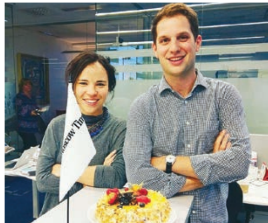
Top: On location, on assignment.