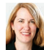
PRESIDENT