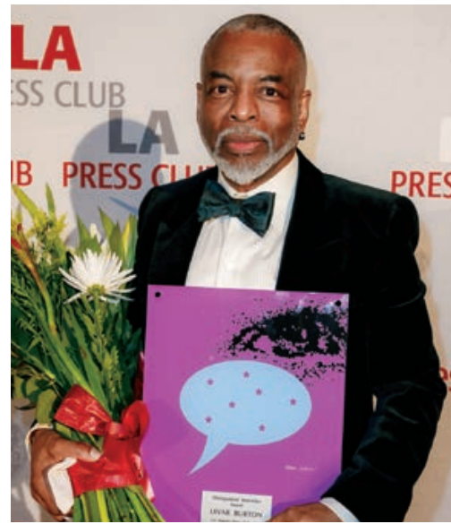
Bottom right: John Leguizamo gave an impassioned acceptance speech for the second President's Award of the evening.

ists to do their job and inform the public. The Club also advised student reporters covering protests on area campuses.