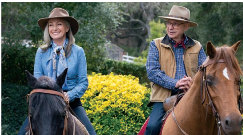
Top: In 2012, Seymour invited Glen Campbell to her studio to participate in a painting session as art therapy as he struggled with Alzheimer's.