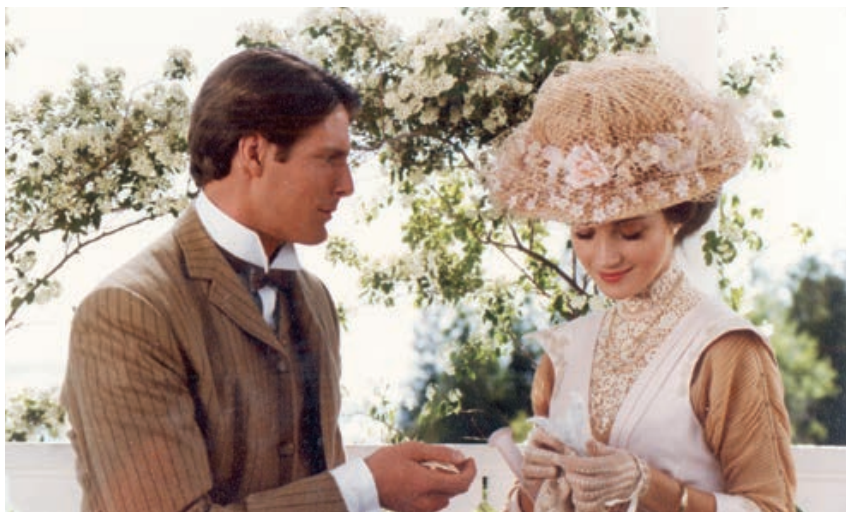
The 1980 time-travel film, Somewhere in Time , starred Jane Seymour and Christopher Reeve.

Seymour has donated not only money, but also helped the organization through sales of