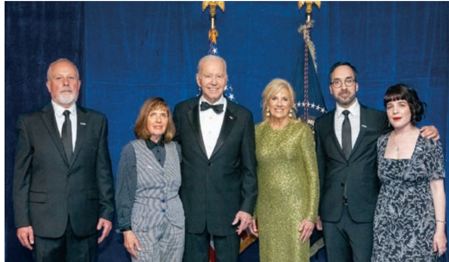
Gershkovich family with President Biden and First Lady at 2023 White House Correspondents Association dinner.