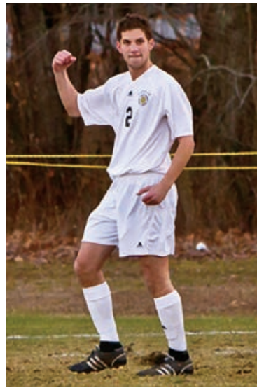
Right: Playing for Bowdoin College in third round of NCAA soccer in 2011.