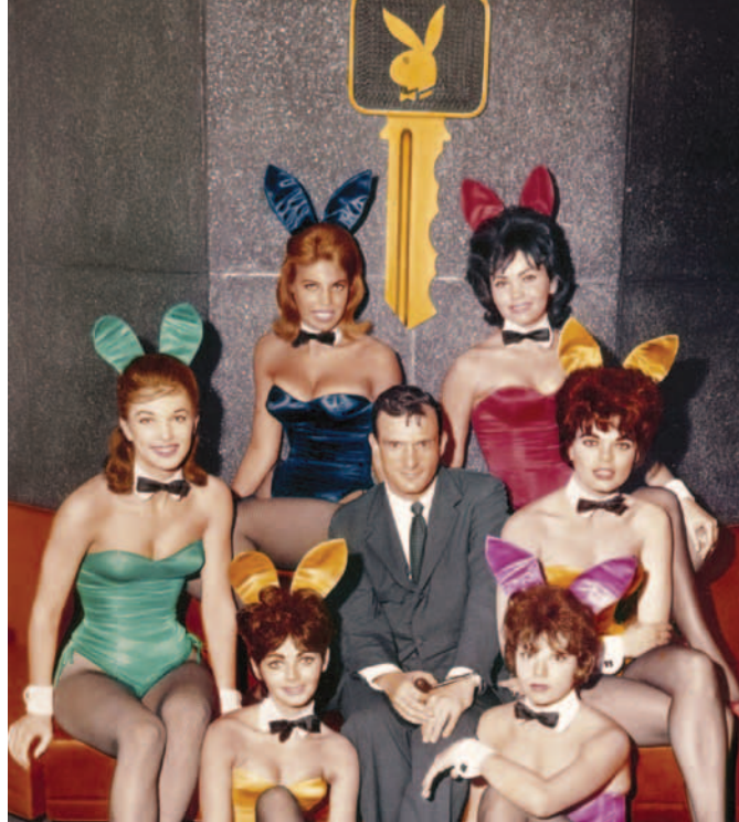
Surrounded by Bunnies at the Playboy Club.

Hefner organized the first Playboy Jazz Festival, a three-day blowout in Chicago that included the biggest names in the form, among them Count Basie, Ella Fitzgerald and Louis Armstrong. Although it would be another two decades until the second festival, it is now a mainstay of the summer at the Hollywood Bowl.