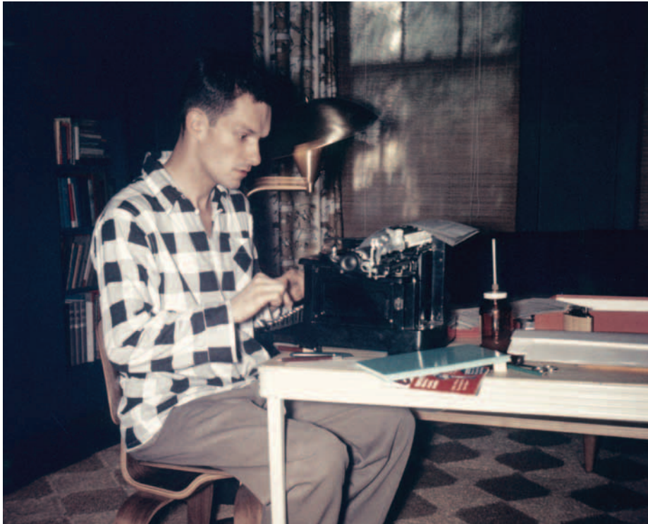
Hefner working at a typewriter on the first issue of Playboy , and holding the magazine with Marilyn Monroe on the cover.