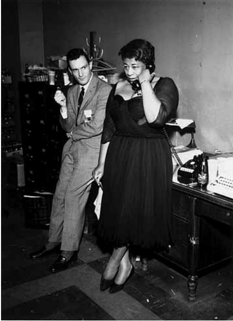
Hefner with Ella Fitzgerald at the first Chicago Playboy Jazz Festival in 1959.