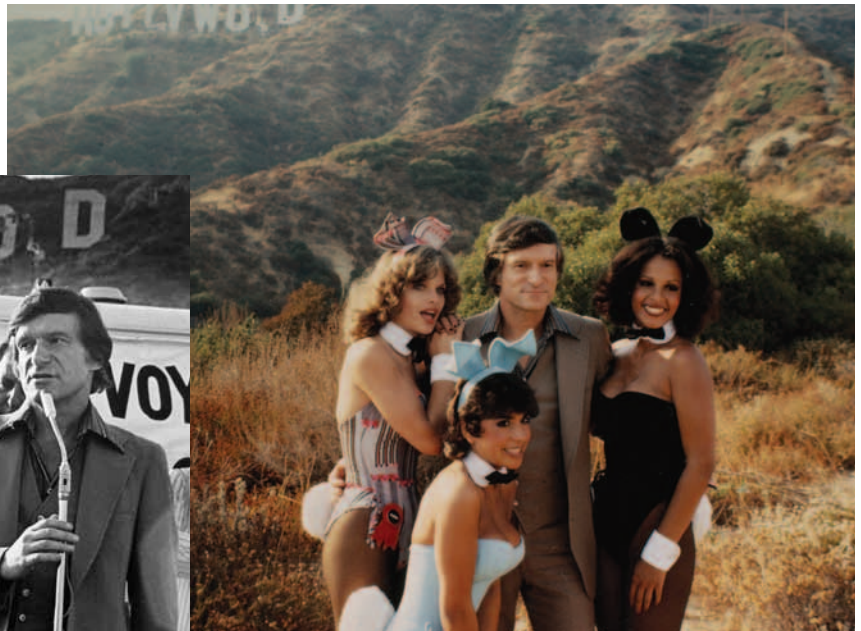
Hefner led efforts to raise funds to save the Hollywood sign which had fallen into disrepair.

It's not the only aspect of Hollywood he's helped preserve. In 1978, when the famous Hollywood sign had become dilapidated, Hefner put up money to repair it. Thirty-two years later, he again came to the sign's rescue: A developer was threatening to build housing on the open space just west of it, and a campaign to acquire the property was short on cash. Hefner donated $900,000. The land is now part of Griffith Park.