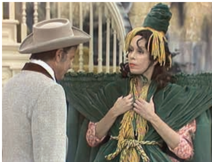
Clockwise from above: Mrs. Wiggins, the secretary to Tim Conway's Mr. Tudwell; The Bob Mackie-designed curtain rod dress in "Went With the Wind" is on display in the Smithsonian; Good friend, Lucille Ball, appeared on her show.