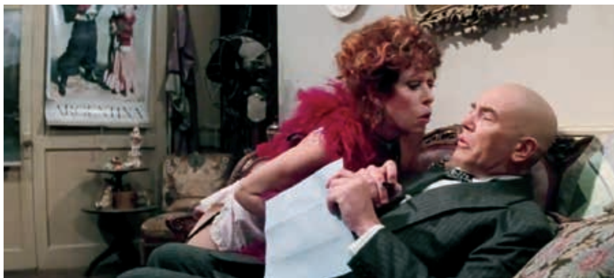
As Miss Hannigan in Annie , with Albert Finney.

She has continued making award-winning TV specials with Julie Andrews, Beverly Sills