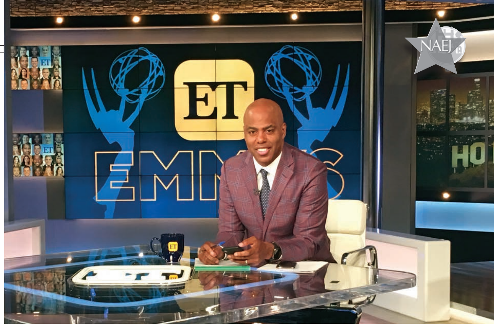
Above: On the "ET" set.