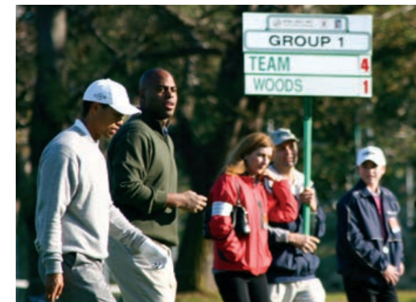
From left: Covering a college basketball game, and walking and talking with Tiger Woods during a golf tournament.

He served as a play-by-play commentator for the University of Cincinnati basketball team, worked as sideline commentator for "NFL on Fox," followed by jobs at Prime Sports and ESPN, where he hosted "Sports Center" and National Basketball Association programming.